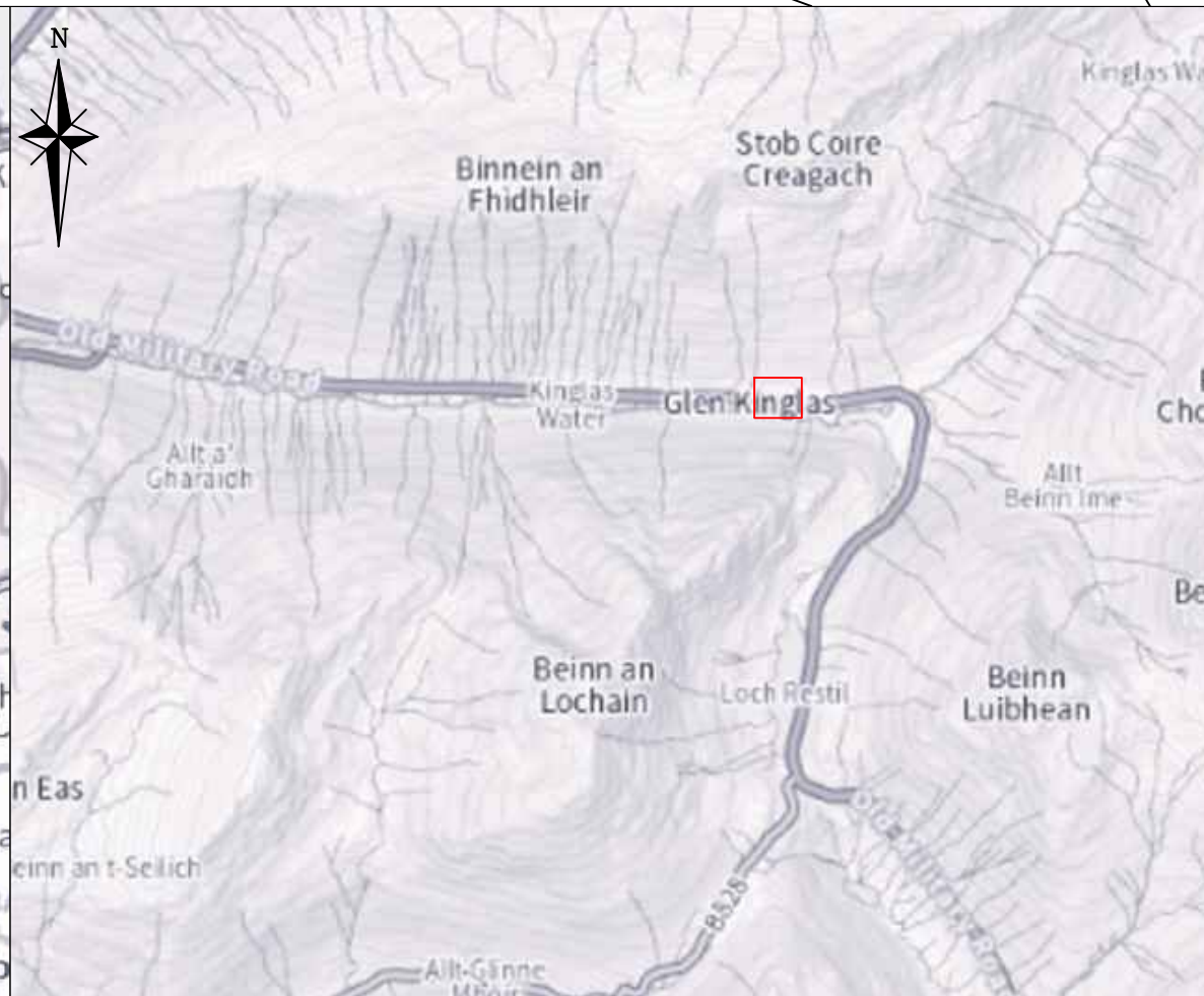
Local Location - Not to Scale